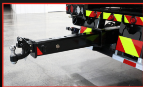
Pintle Hitch Hydraulic Extension