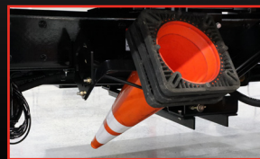
Traffic Cone Storage