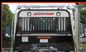
Chain Racks on Headboard