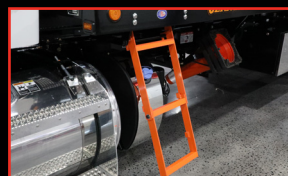
3 Step Folding Ladder