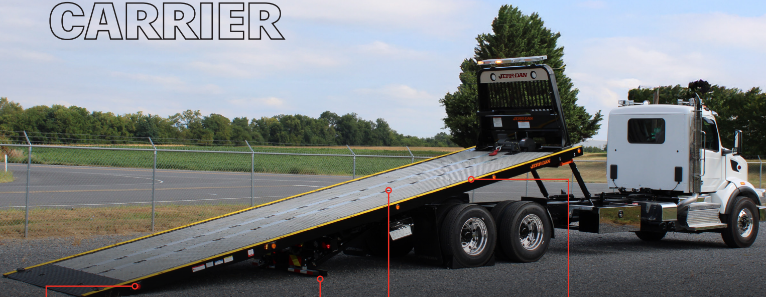
Rear Awareness Indicator Lights (RAIL)

Visit jerrdan.com for more info on warranty.